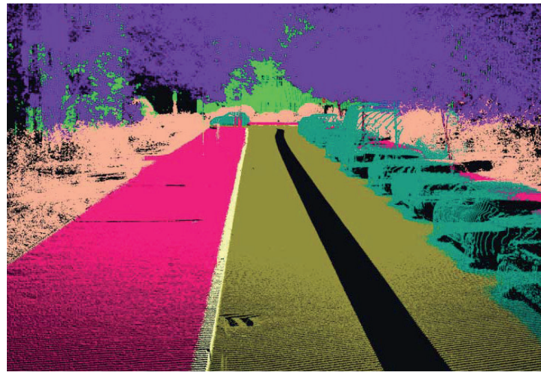
Left: Textured point cloud, reconstructed from data taken at 50 km/h with a CPS laser scanner and four cameras. Right: Automatically segmented point cloud. Data interpretation was realized by using an automated 3D data interpretation software 3D-AI developed by Fraunhofer IPM.

tailored to the requirements of our customers by integrating and fully calibrating the appropriate components: from the desired number of cameras and laser scanners, to several optional 360° panorama cameras for documentation, low budget or high-end IMU/GNSS solutions with odometer, or appropriate laser scanners.